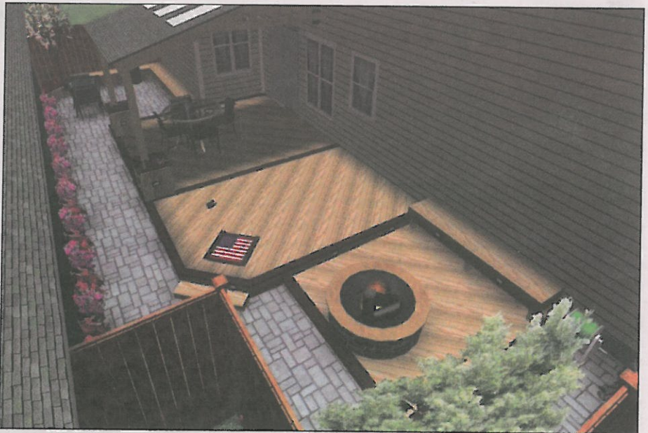
Illustration courtesy NADRA